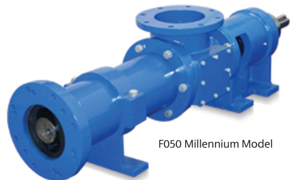
F050 Millennium Model